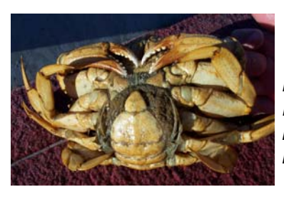
Left: Gravid female Dungeness crab holding up to 2.5 million fertilized eggs

Gravid Female Dungeness Crab Habitat Survey- This study will identify gravid female crab habitat areas in Snohomish County. Collected data will be analyzed and used to promote appropriate means of protection for productive gravid female crab habitat. The study protocols and preliminary maps were completed June 2007, and field mapping is anticipated for completion by February 2008.