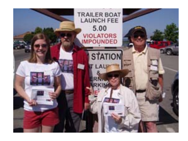
Above: Beach Watchers distribute escape cord education materials