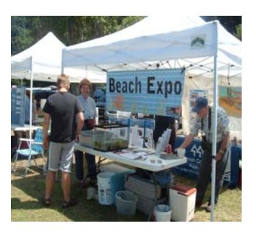
Above: MRC display at a Beach Expo