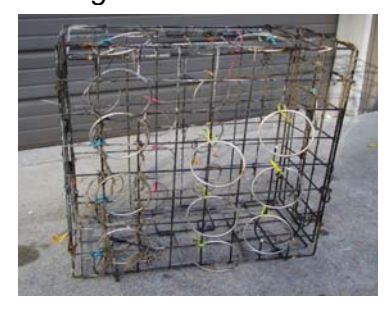
Above: A crab pot from the degradation rate study