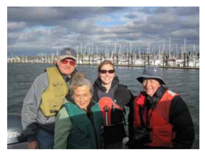
Above: Partnerships with local agencies help make the work of the MRC possible. Here the Snohomish County Sheriff's Department contributed their services and boat to take Mussel Watch volunteers to the sampling site on Hat Island.