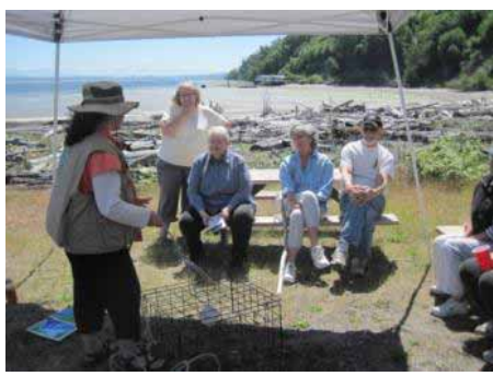
Above: Hat Island Beach Expo

Landowner Workshops – Held two workshops for shoreline and bluff landowners in Stanwood and Tulalip. The MRC partnered with WSU Snohomish County Extension, Tulalip Tribes and Snohomish County SWM and Conservation District to teach over 60 individuals about water quality improvements, erosion control, natural yard care and more!