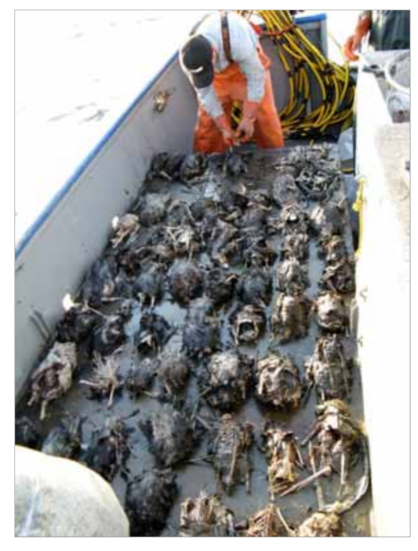
Above: A fraction of the 142 birds removed from a single derelict fishing net removed from Port Susan in June 2008. The net contained a total of 1634 animals including birds, fish, invertebrates, and a harbor seal.