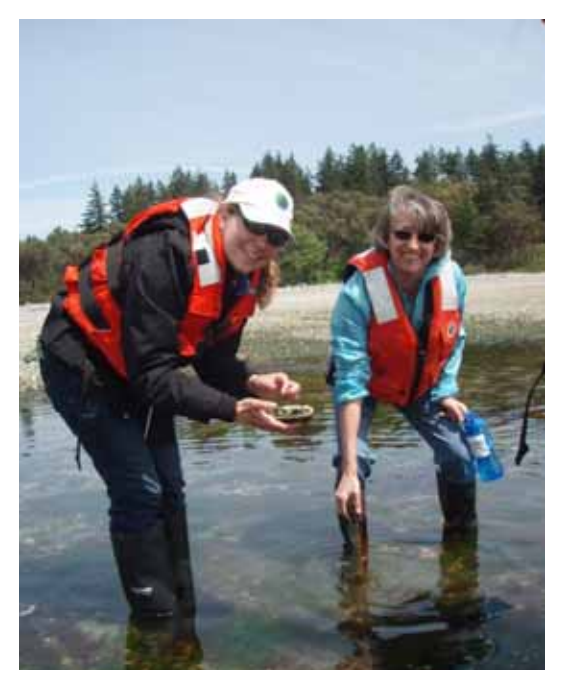
Above: Education training at B-WET workshop

The MRC is now implementing a number of marine conservation outreach, research and on-the-ground projects focused on leveraging funds and expanding partnerships throughout the county. The MRC is proud of its accomplishments over the past year, and looks forward to continuing its efforts to benefit the marine resources and the citizens of Snohomish County in 2011 and beyond.