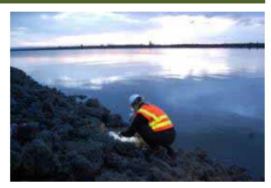
Above: Mussel Watch sampling at Everett CEMEX site

Marine Water Quality, Science, Education & Outreach