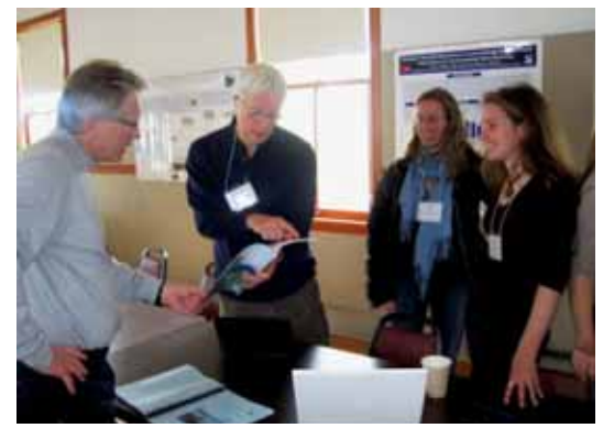
Above: A MRC member shares mussel watch data at the SETAC conference