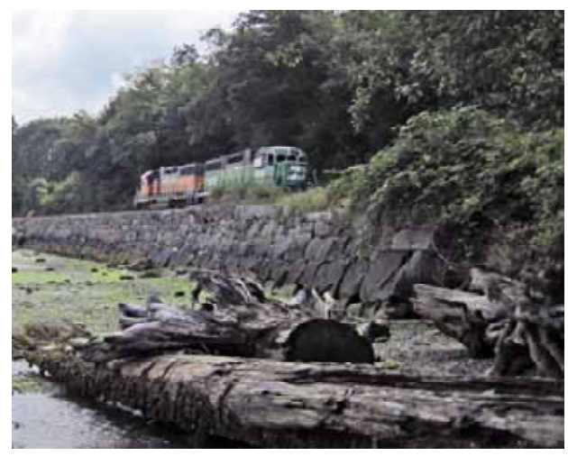
Above: Railroad bulkhead during low tide