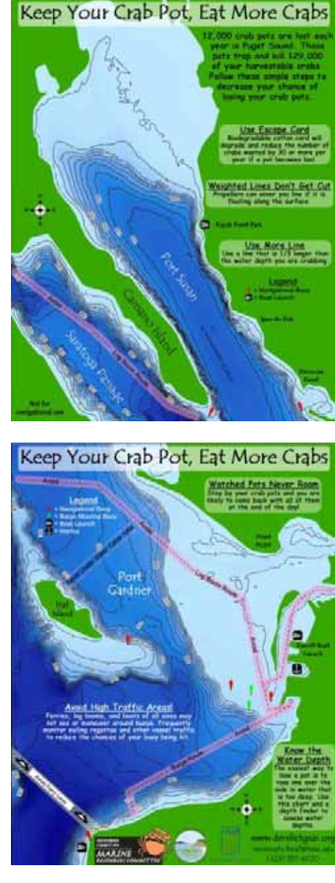
Above: Recreational Crabber Nautical Chart

Education & Outreach, Marine Life, Marine Habitat