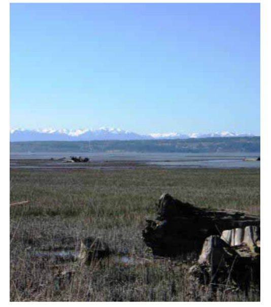
Above: Port Susan Bay

Together these partners and local volunteers contributed 995 volunteer hours in 2010!