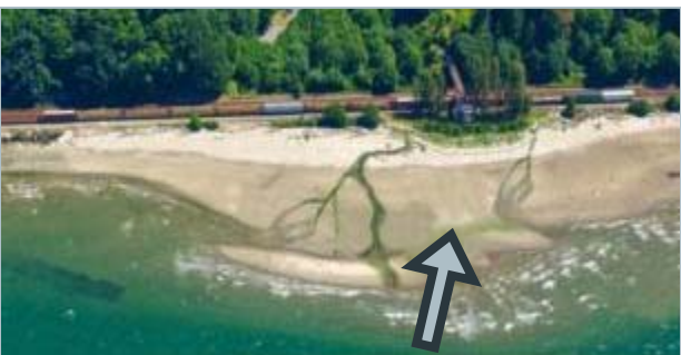
Howarth Park at present (above) and artist's rendering of the restoration project (below)