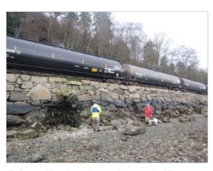
Train travelling along the nearshore south of Everett

Derelict Vessel Removal - MRC Staff and members worked with the Washington Department of Natural Resources (WDNR) to support removal of seven derelict vessels in the Snohomish River Estuary September. This is a great partnership between Snohomish County Public Works, the MRC, Snohomish County Sheriff's Department and WDNR. This partnership provided almost $400,000 in state funds to Snohomish County to help address pollution and habitat concerns that have affected the estuary for a number of years.