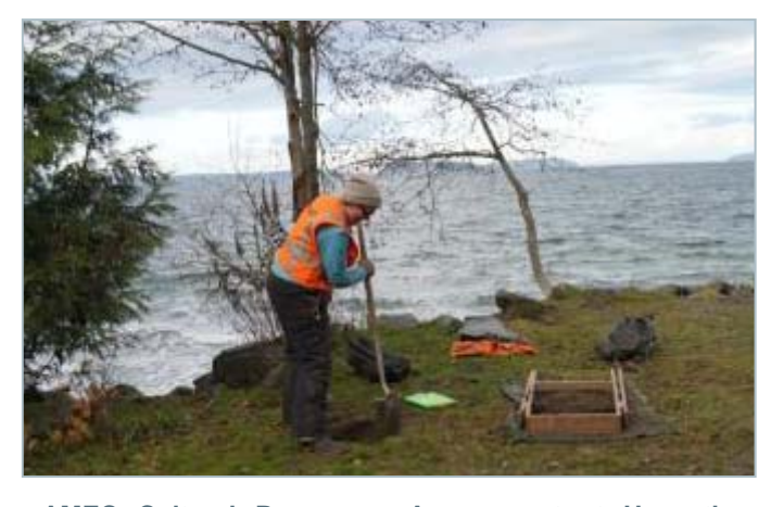
AMEC Cultural Resources Assessment at Howarth Park

In early 2014, AMEC Environmental and Infrastructure, Inc. conducted a cultural resources assessment at Howarth Park, site of the Snohomish County Nearshore Beach Restoration project. No historic properties were found at that time.