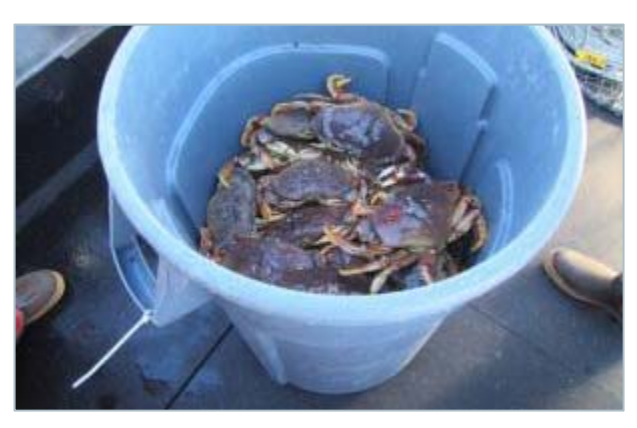
Dungeness crab being collected for the Crab Pot Escapement Study