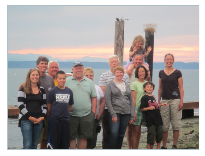
Snohomish MRC Members, Staff and families at summer potluck in Port Susan

MRC members represent a diverse group of environmental, recreational. conservation, economic, local and tribal government interests. The MRC is part of the Northwest Straits Marine Conservation Initiative (NWSI), guided by the Northwest Straits Commission (NWSC) and the Northwest Straits Foundation (NWSF). Together these entities comprise a non-partisan regional effort to protect and restore marine resources in northern Puget Sound and the Strait of Juan de Fuca. Snohomish County Public Works Surface Water Management Division (SWM) provides staff support for the MRC.