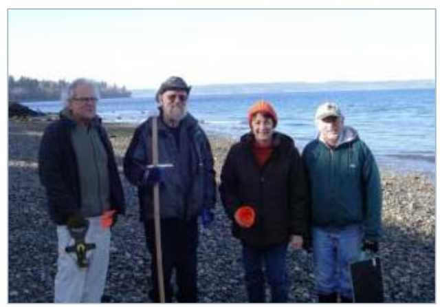
Snohomish County Beach Watchers assist with forage fish spawning surveys at Howarth Park