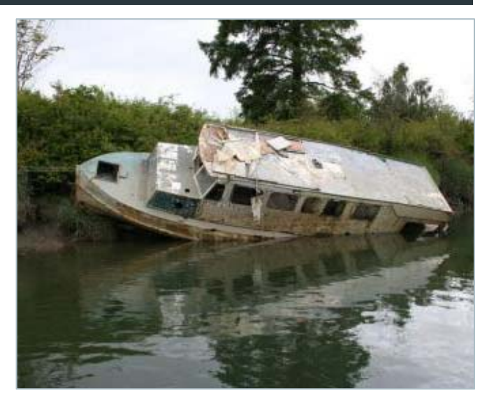
One of seven derelict vessels removed from Steamboat Slough