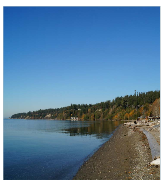
View of Port Susan from Kayak Point County Park