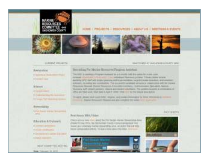
MRC Website: www.snocomrc.org

The MRC website features a user-friendly interface and individual project pages. It is regularly updated with events, project progress and interesting marine-related information. In 2014, the site received over 4,000 visits.