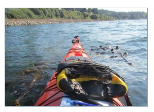
Kelp monitoring via sea kayak