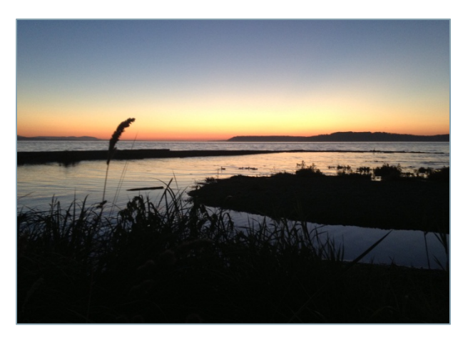
Lund's Gulch Creek entering Possession Sound at Meadowdale Beach Park