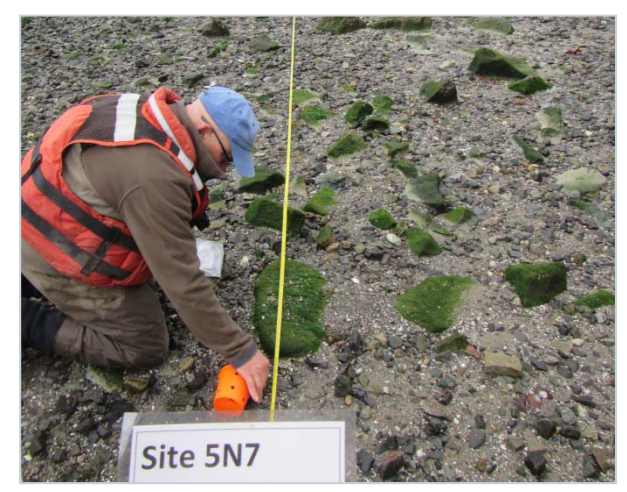
Volunteer Craig Wollam collecting sediment to look for forage fish eggs

Key partners include WSU Snohomish County Extension Beach Watchers and forage fish expert, Dan Penttila.