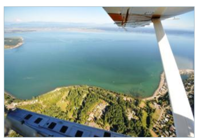
Aerial photo of Port Susan from Cavalero Point