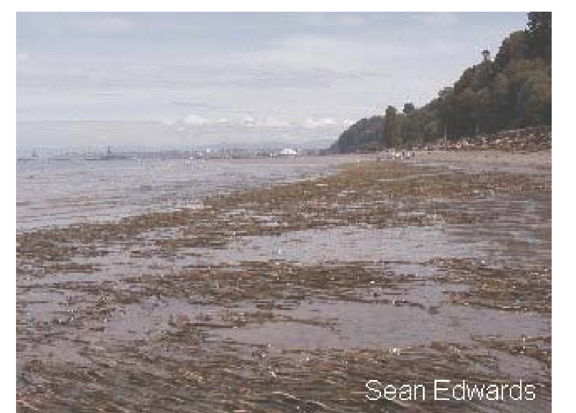
Eelgrass bed at low tide