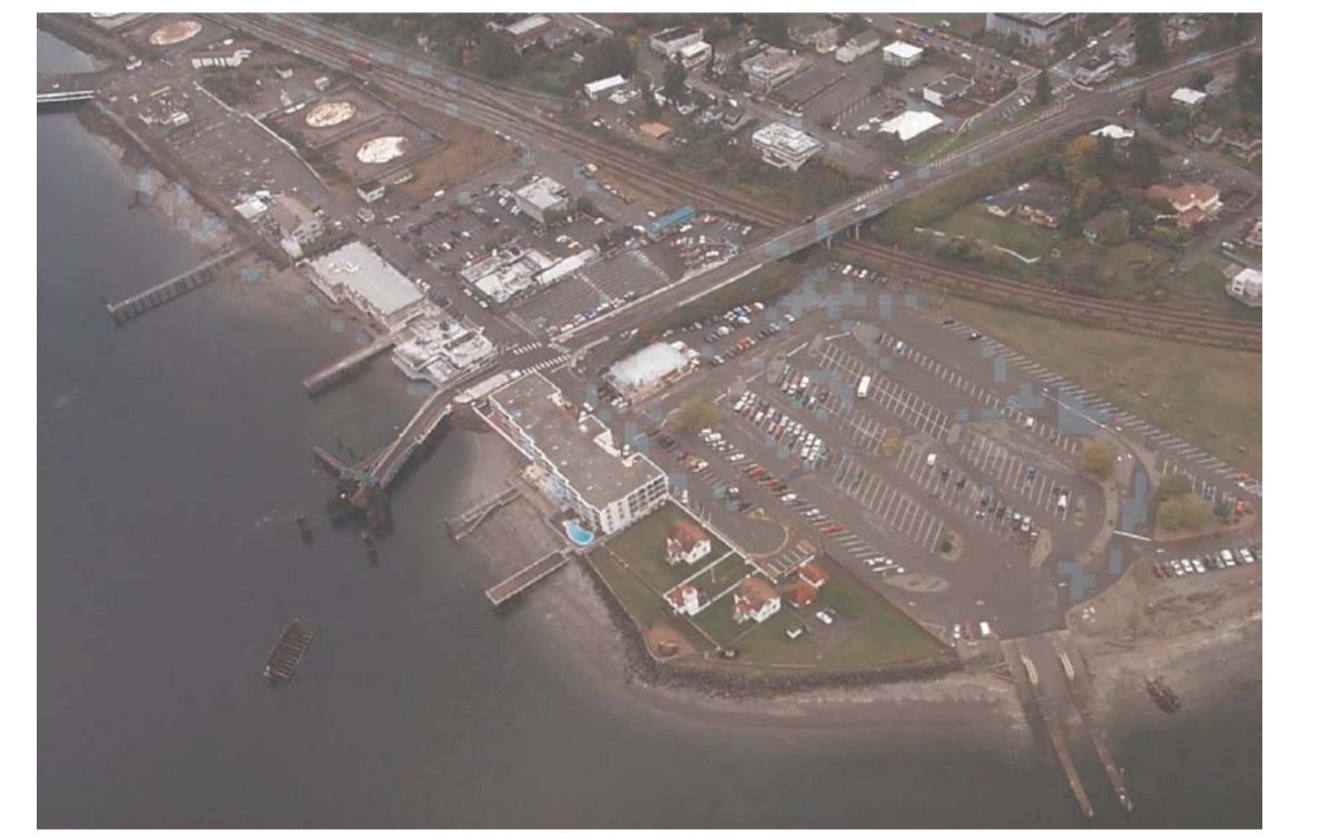
Waterfront development and railroads