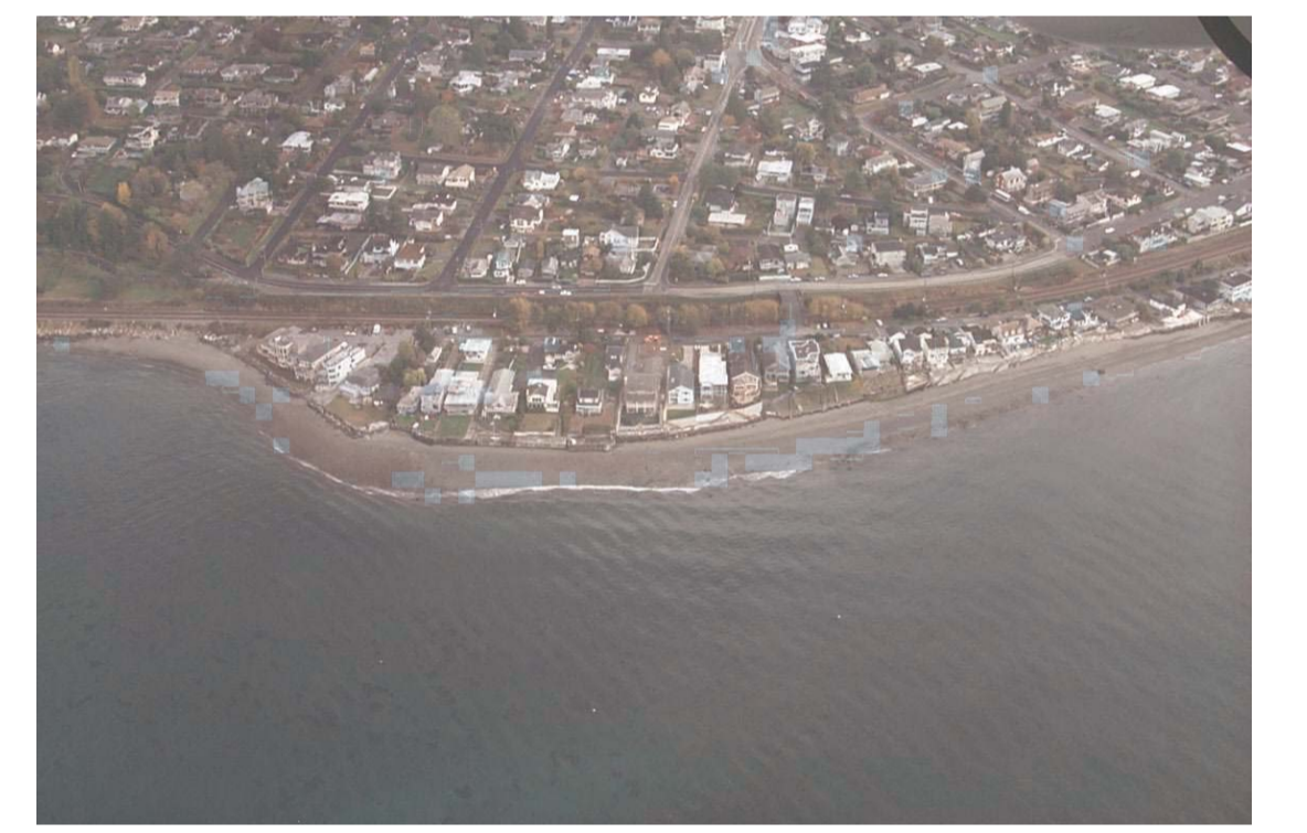
Bulkheading along beaches