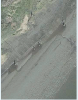
Scour hole depressions visible around pilings

This project has been funded wholly or in part by the United States Environmental Protection Agency. The contents of this document do not necessarily reflect the views and policies of the Environmental Protection Agency under Assistance Agreement [CE-01J65401]. The contents of this document do not necessarily reflect the views and policies of the Environmental Protection Agency, nor does mention of trade names or commercial products constitute endorsement or recommendation for use.